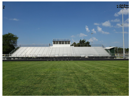
Home Bleachers and Press Box

As many of you will remember USD 312 passed a school bond in June of 2015. Many upgrades were made possible because of this successful election. We are very appreciative of how our district patrons support has allowed us to make several improvements. Last spring the final dollars of the 12 million dollar bond were spent to upgrade the bleachers and lights at the stadium. Our school board followed this up with allocating some extra funds to rework the entrance and also to update the scoreboard. By approving these projects, the district was able to do an overall renovation to this facility. The updates not only have provided us a facelift that will give us a facility that we can all be proud of but has also provided a much safer set of bleachers. After the bond dollars were spent the remaining funds for this project came from the Capital Outlay Budget. Let me share some information about Capital Outlay Budgets as it relates to our spending and plans for the future. Capital Outlay is supported mostly from local taxes. This is determined by a mill levee that is approved each year as part of the overall budget. Our district has been somewhat conservative with this budget so that we can use it for these substantial upgrades across our district. The Kansas State Department of Education provides the following language to outline the purpose of these funds: