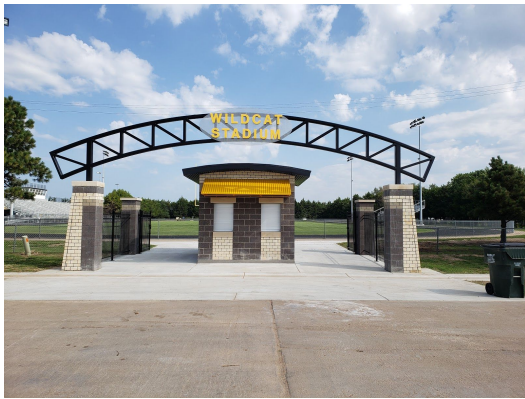
New Entry to District Stadium